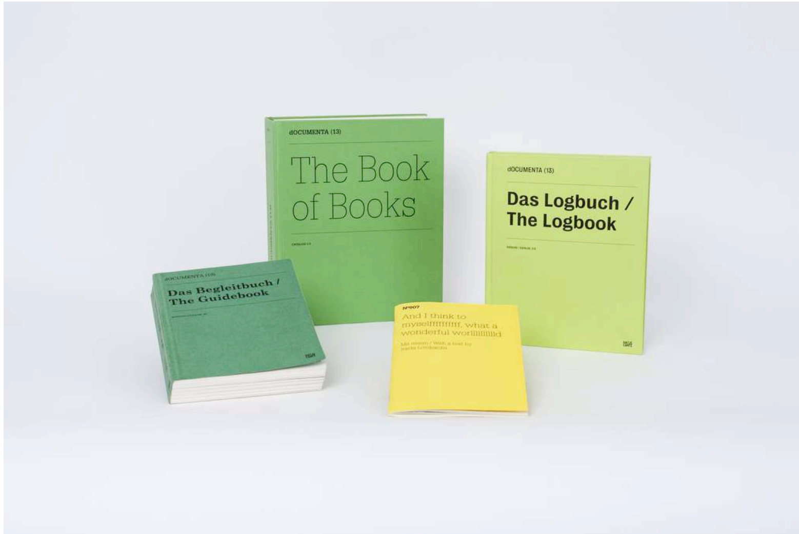
And I think to myselfffffff. What A Wonderfulllllllll Worl, 2012.