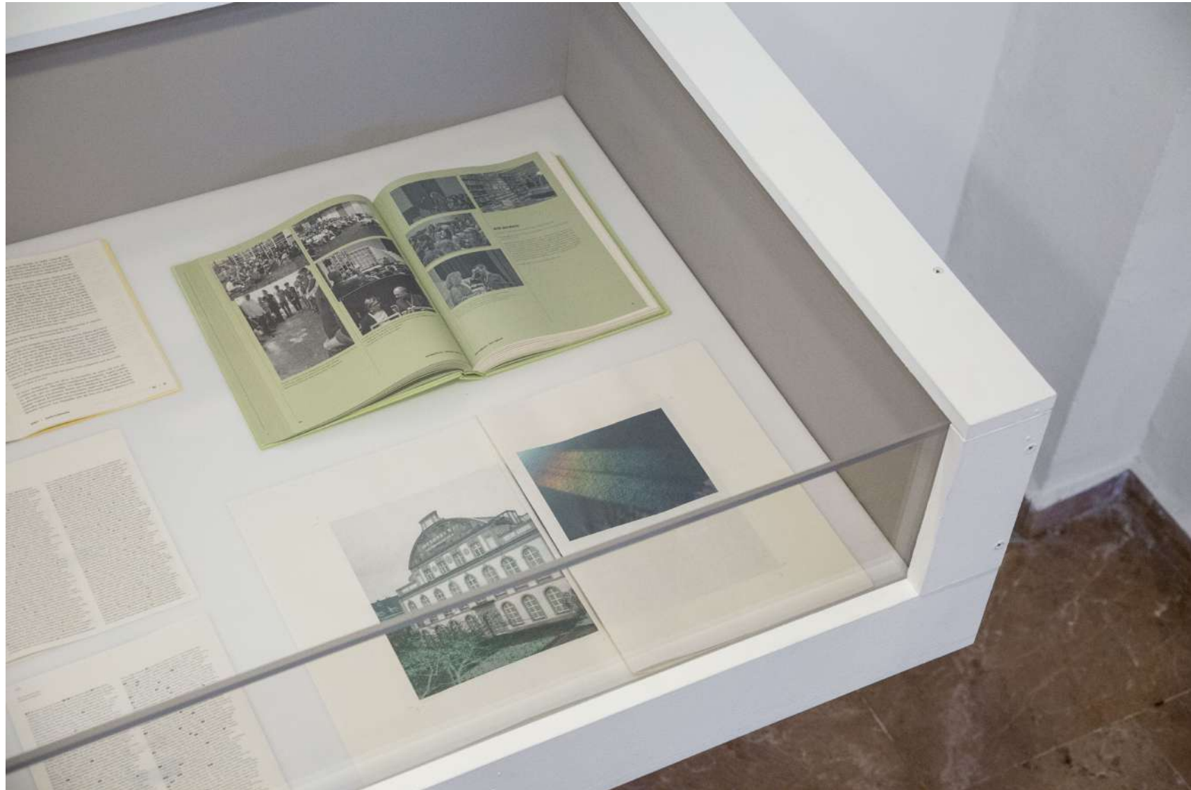
And I think to myselfffff. What A Wonderfulllllllll World. Vista exposición en Alarcón Criado 2016-2017/ Exhibition view in Alarcón Criado, 2016-2017