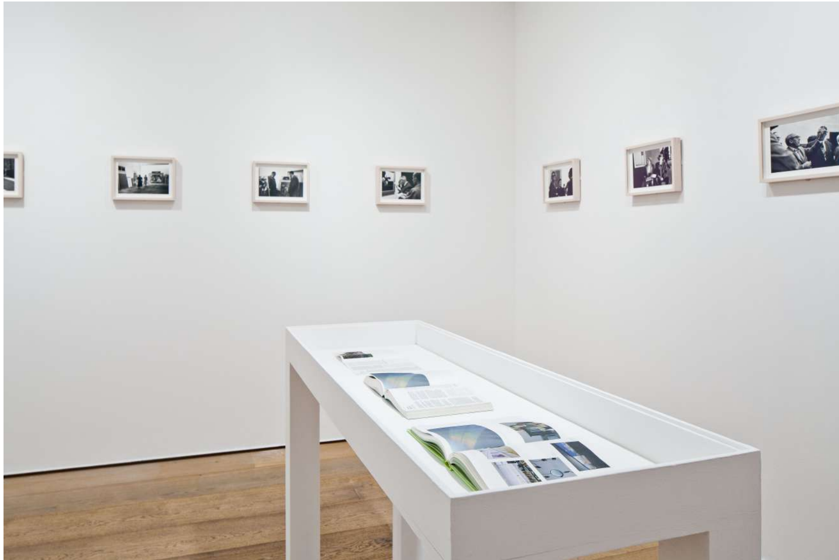
And I think to myselfffff. What A Wonderfulllllllll World. Vista exposición en la Bienal de Liverpool, 2014 / Exhibition view in Liverpool Bienale, 2014