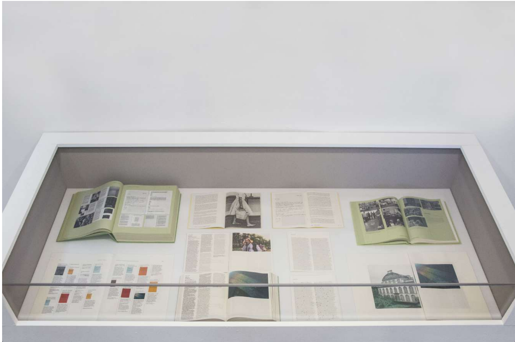
And I think to myselfffff. What A Wonderfulllllllll World. Vista exposición en Alarcón Criado, 2016- 2017/ Exhibition view in Alarcón Criado, 2016- 2017