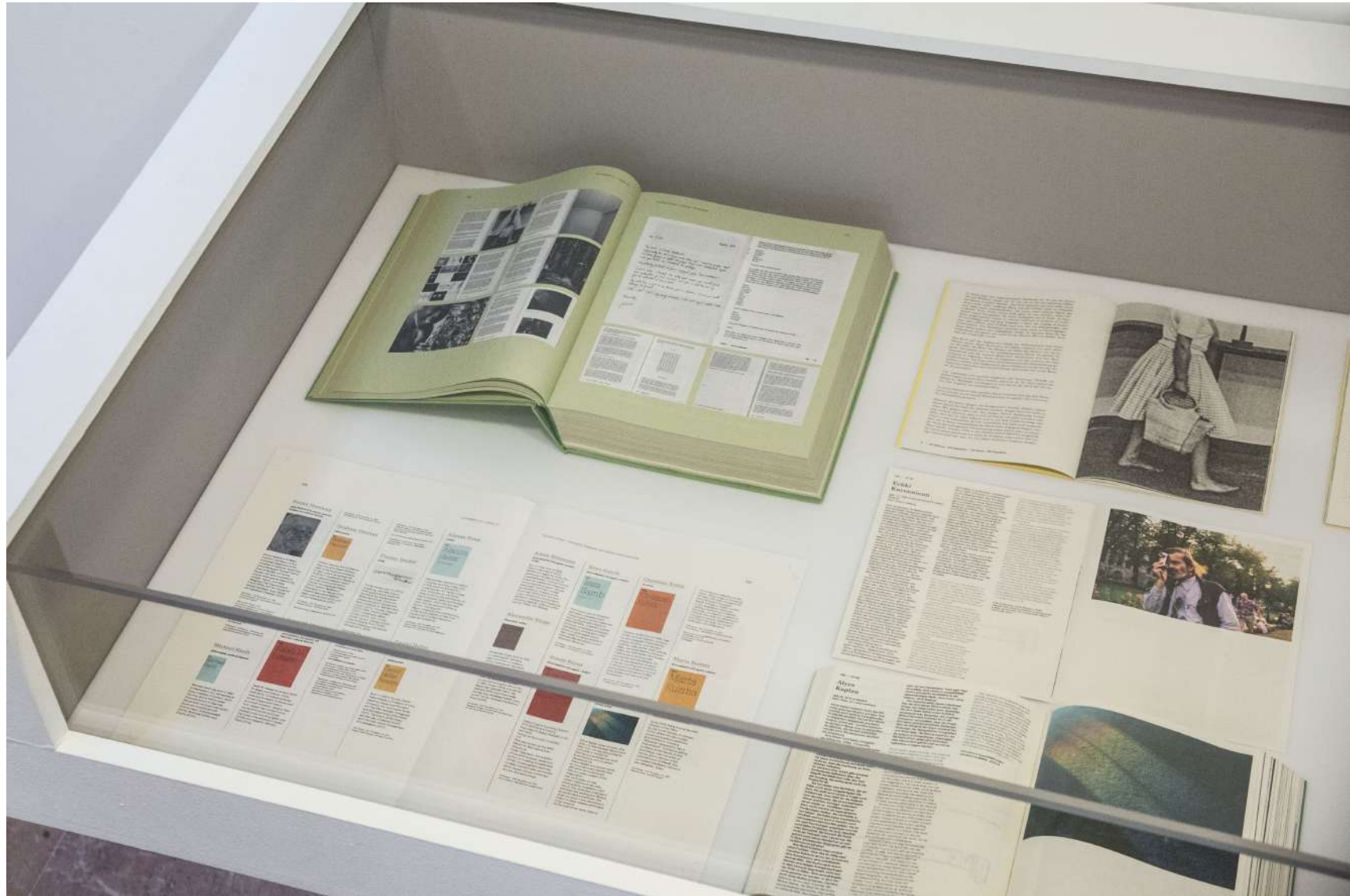
And I think to myselfffff. What A Wonderfullllllllll World. Vista exposición en Alarcón Criado 2016-2017/ Exhibition view in Alarcón Criado, 2016-2017