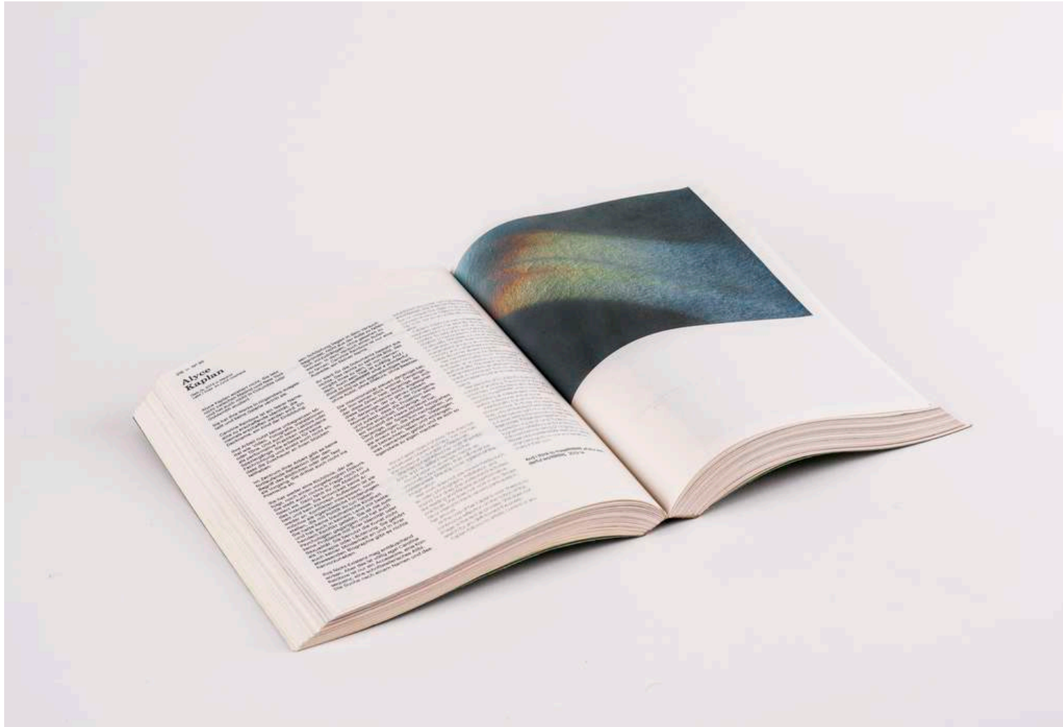
And I think to myselfffff. What A Wonderfulllllllll Worl, 2012.