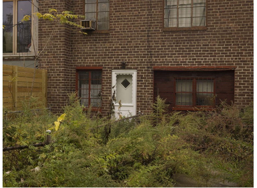
Mohammed, Tehran 2011 / Sharon St, Brooklyn NY 2010