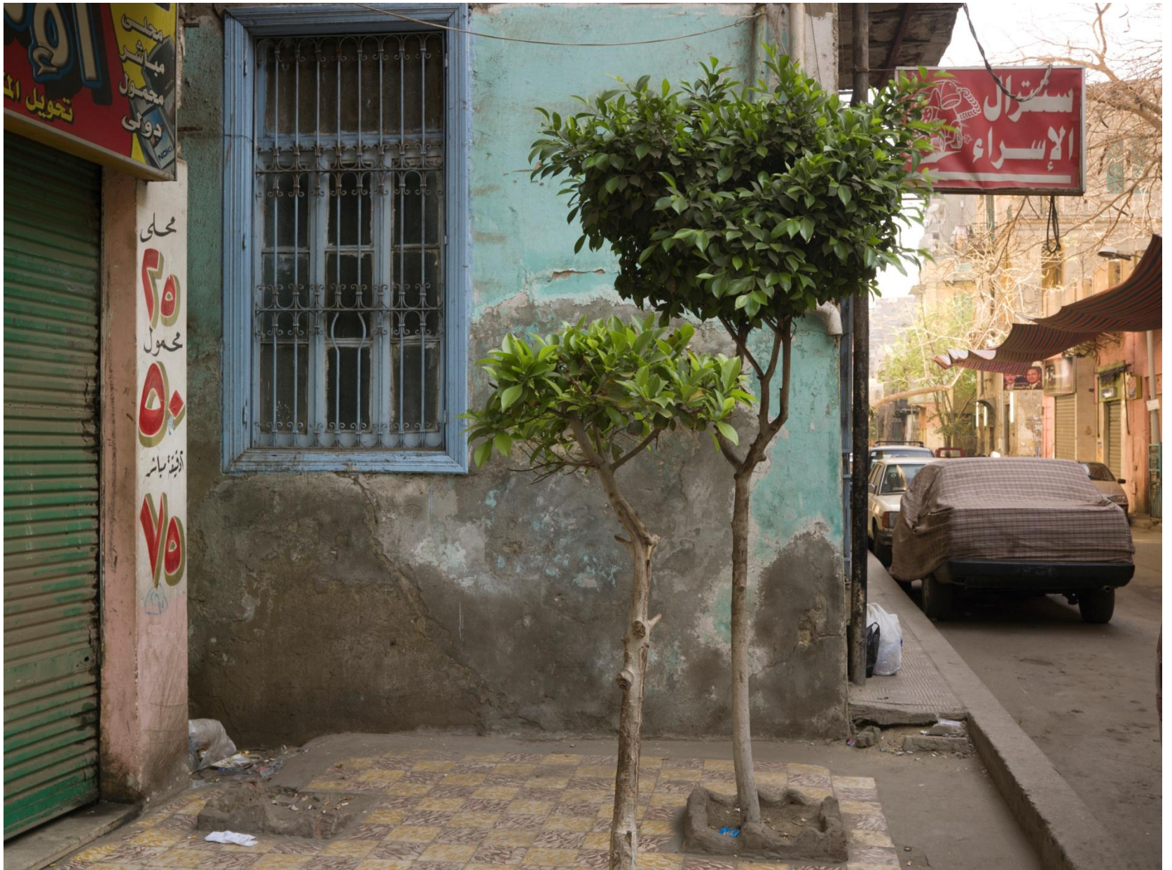
Port Said-Al Geish (trees), Cairo 2008