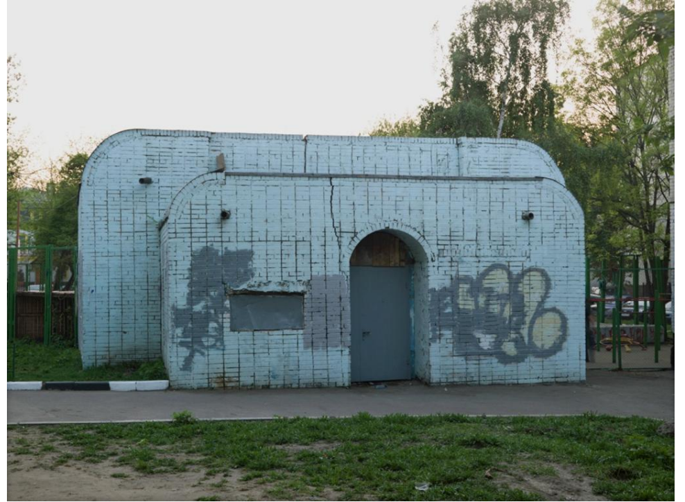
Al Mukatan, Cairo 2008 / Moscow, 2008