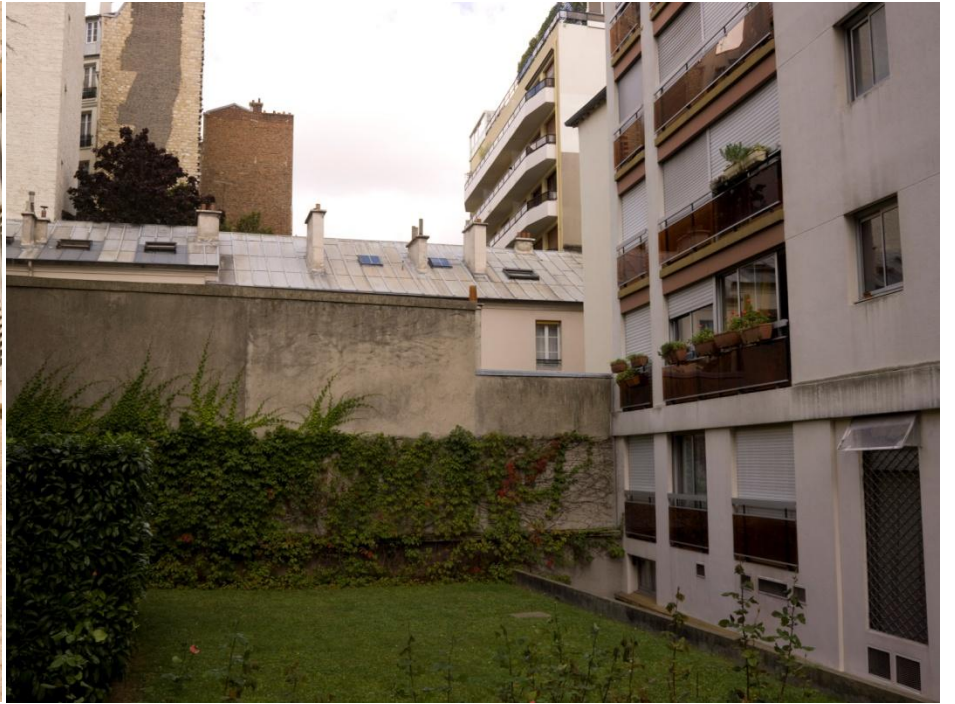
Giza, Cairo 2008 /Lemaignan, Paris 2008