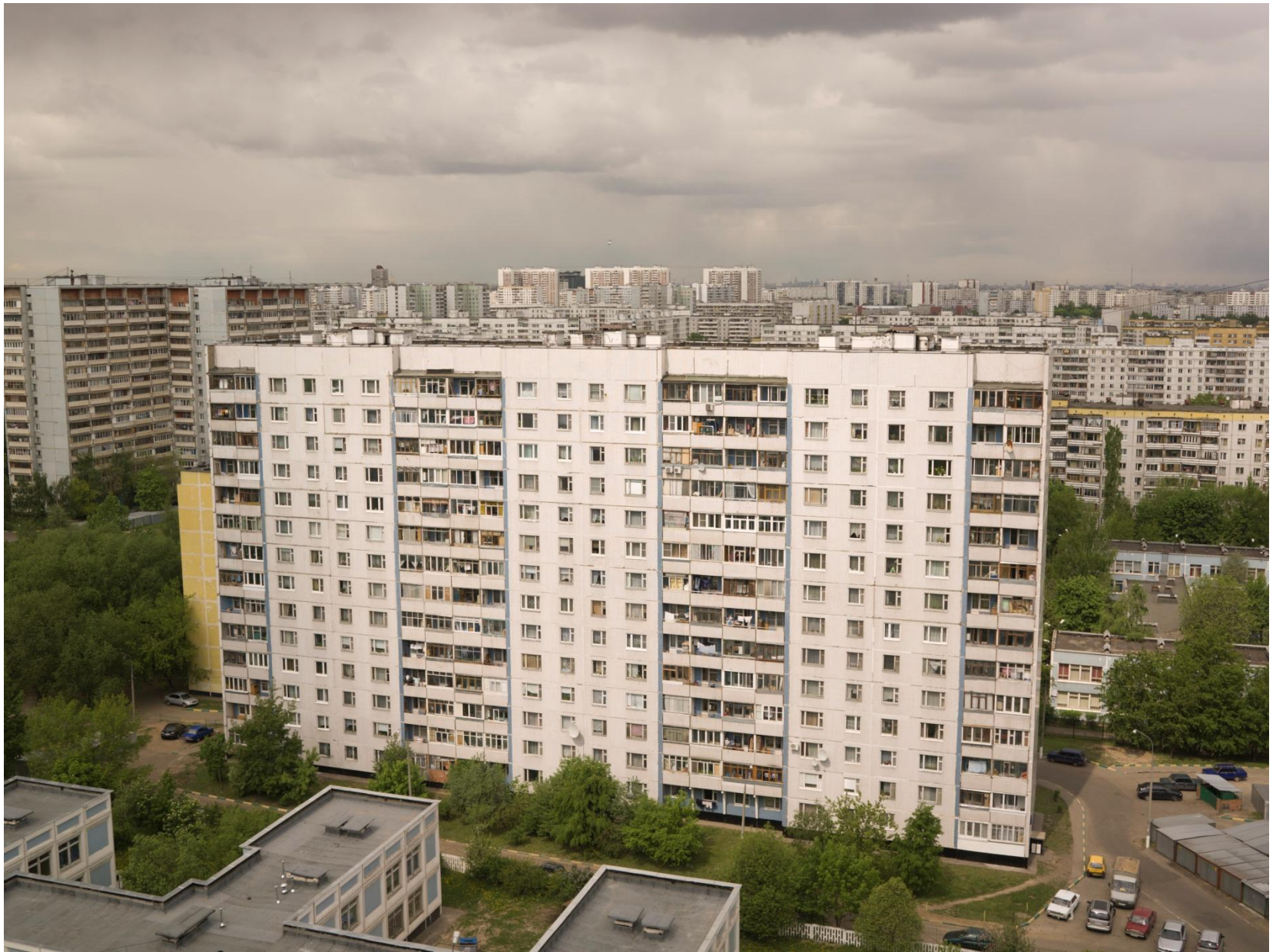
Krasnogardeskaya, Moscow 2008