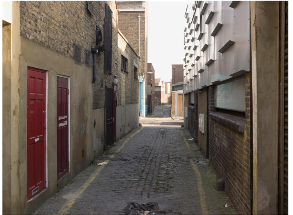
Port Said-Al Geish, Cairo 2008 / London 2008