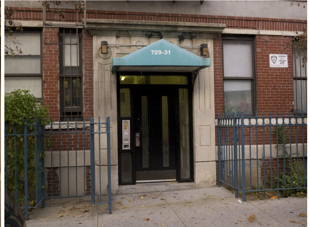
Verianak, Tehran 2011 / East 147 th St, Bronx NY 2010