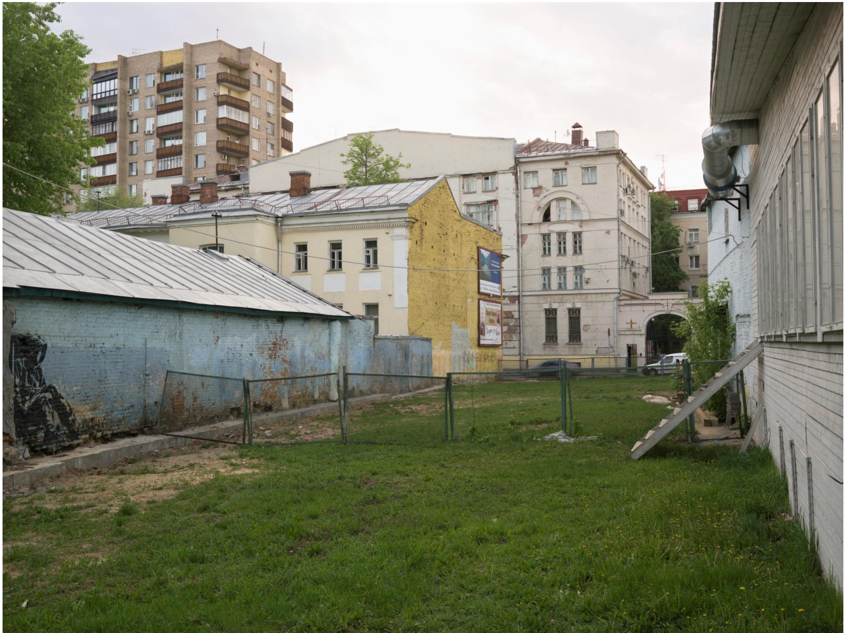
Tverskoy Bulvar, Moscow 2008