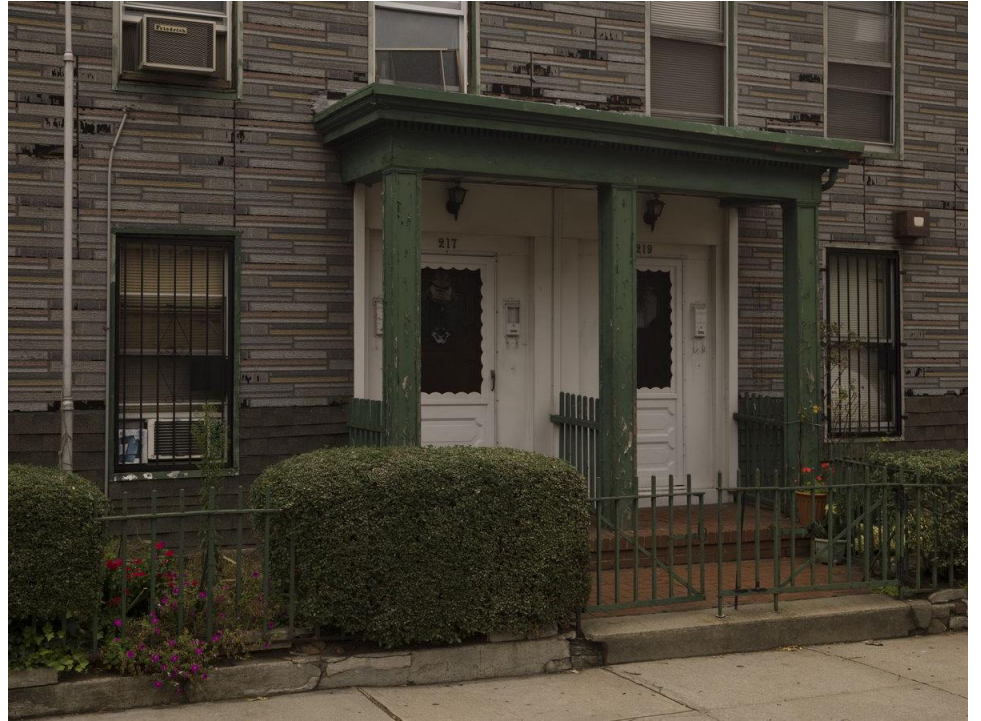
Verianak, Tehran 2011 / Devoe St, Brooklyn NY 2010