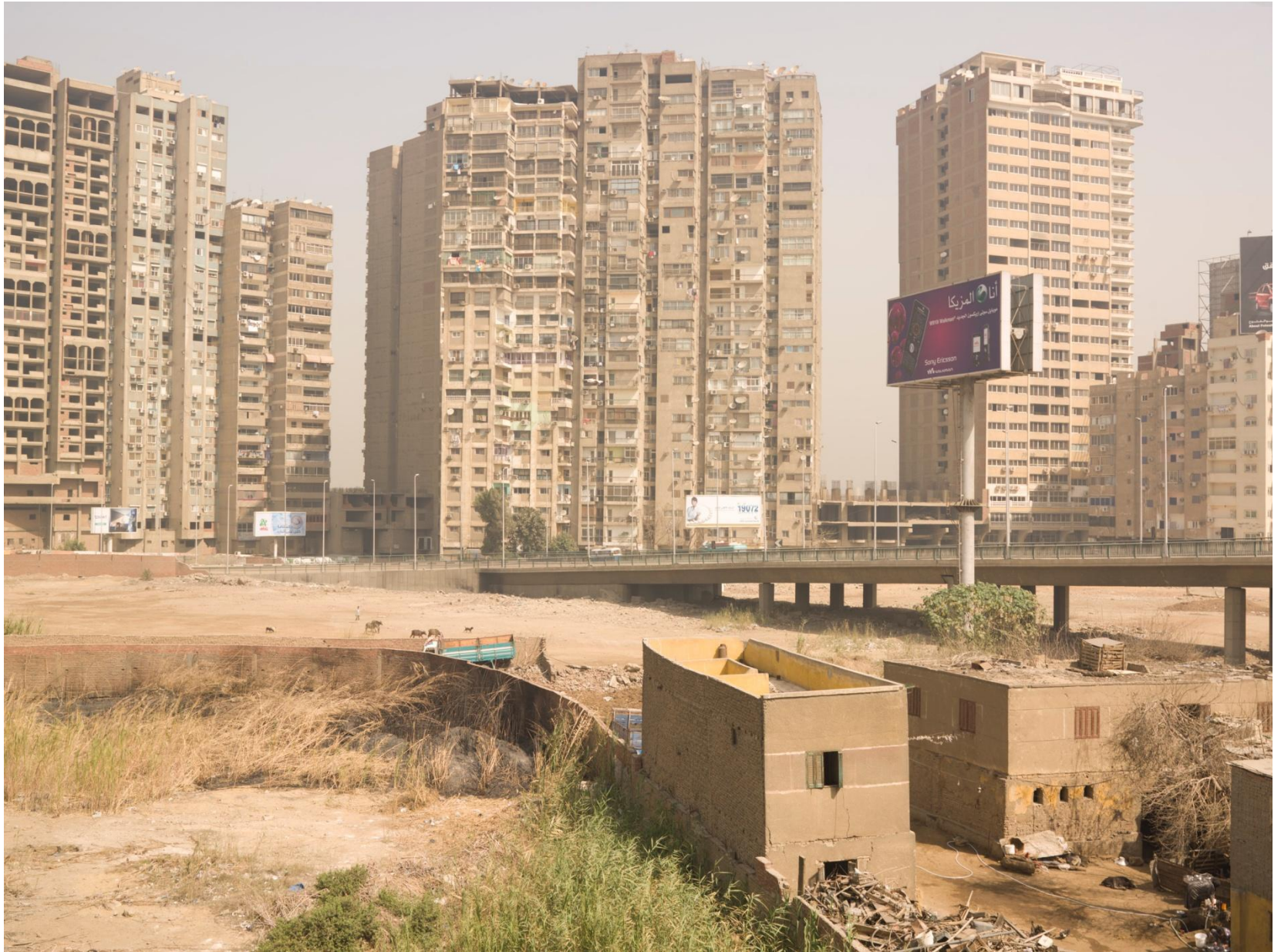
Dar El Salam, Cairo 2008