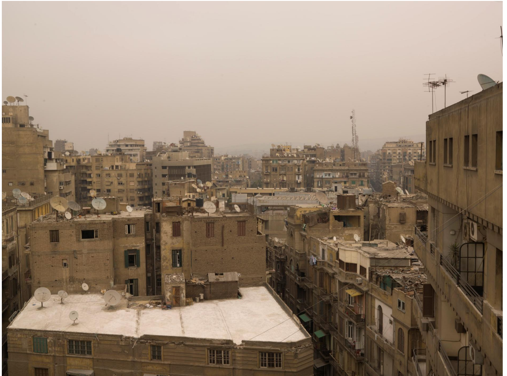
Ismailia View, Cairo 2008