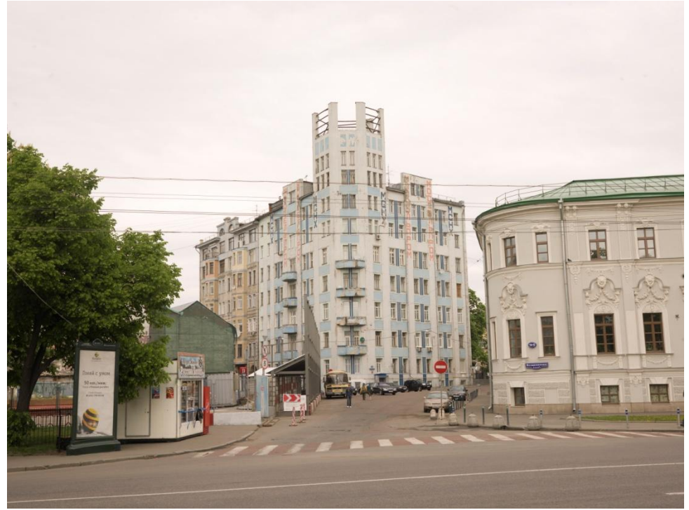
The Borough, London 2008 / Arbat Street, Moscow 2008