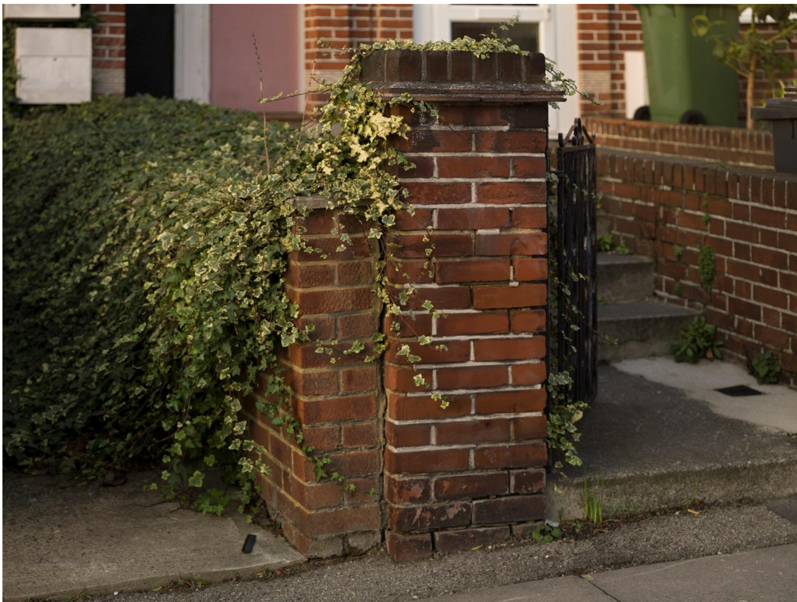
Catford, London 2008