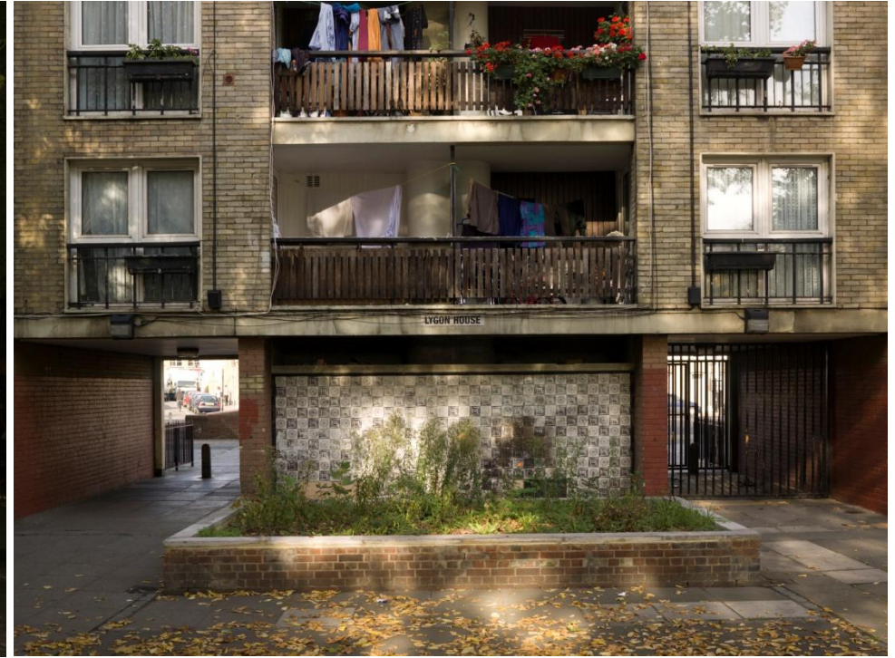
Moscow 2008 / Hoxton, London 2008