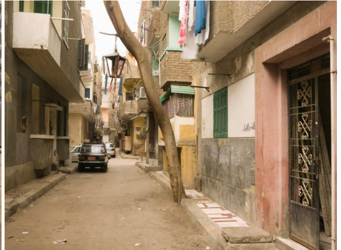
Pont de Grenelle, Paris 2008 / Komsomolsky, Moscow 2008 / Shubra, Cairo 2008