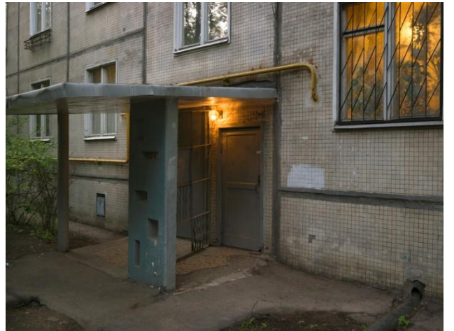
London 2008 / Ramsis-Al Zahir, Cairo 2008 / Rechnoy Vokzal, Moscow 2008