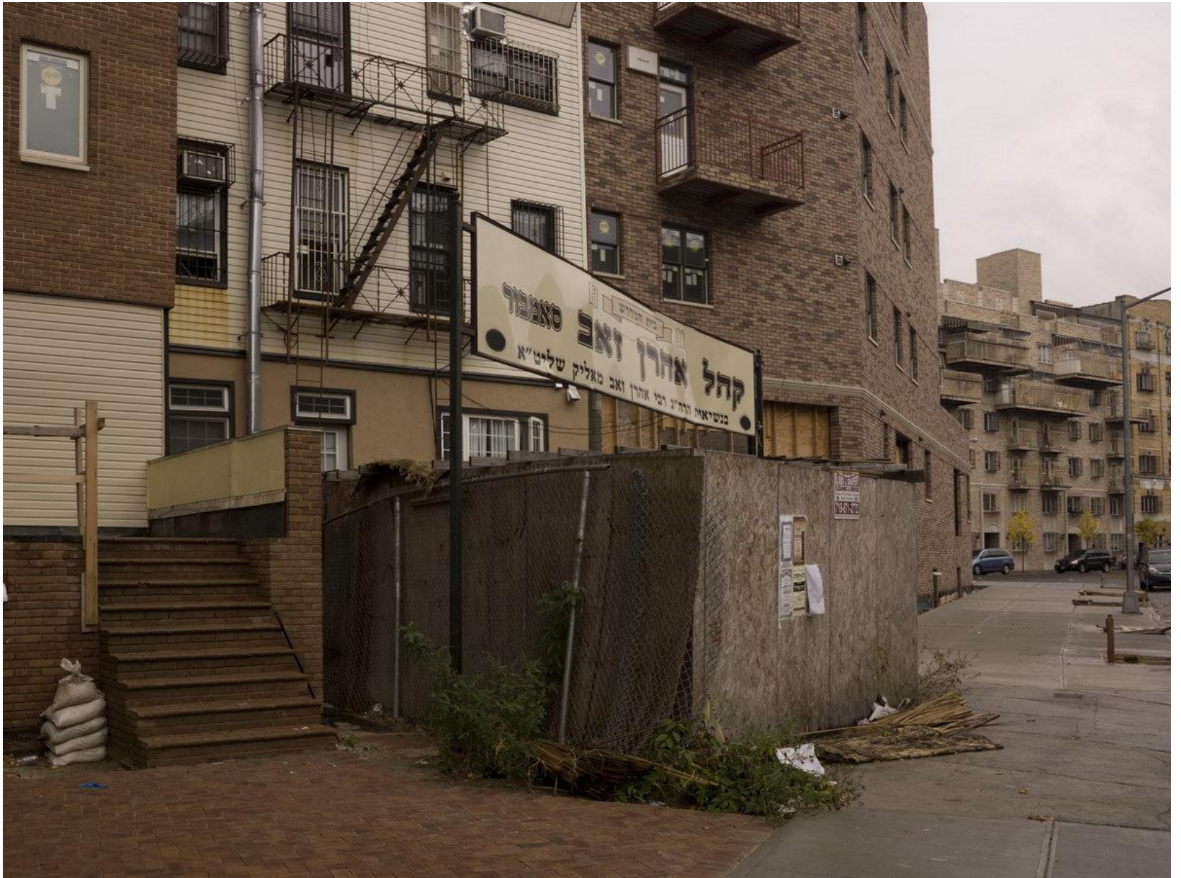
Walton St, Brooklyn NY 2010