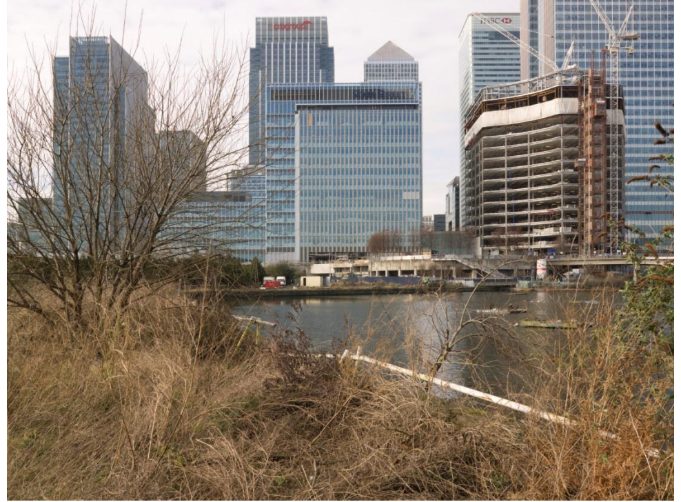
El Sayeda Zeenab (Aqueduct), Cairo 2008 / Docklands (Canary Wharf), London 2008