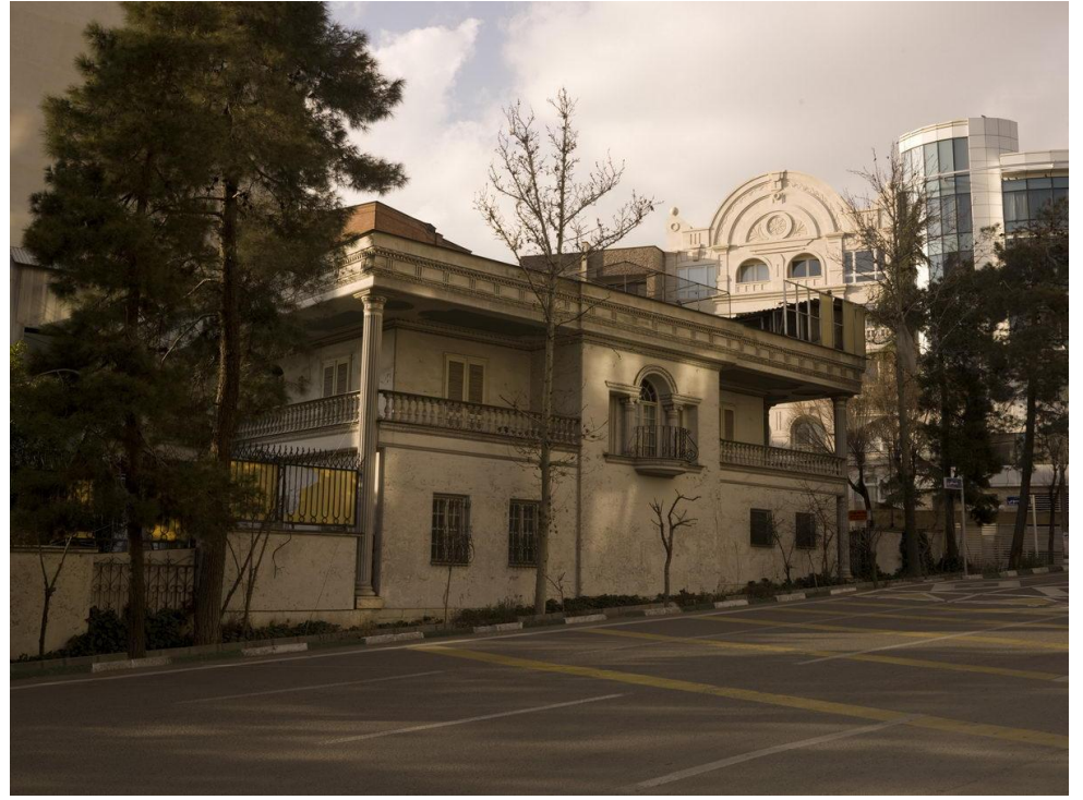
Devoe St, Brooklyn NY 2010 / Pasha Zohri St, Tehran 2011